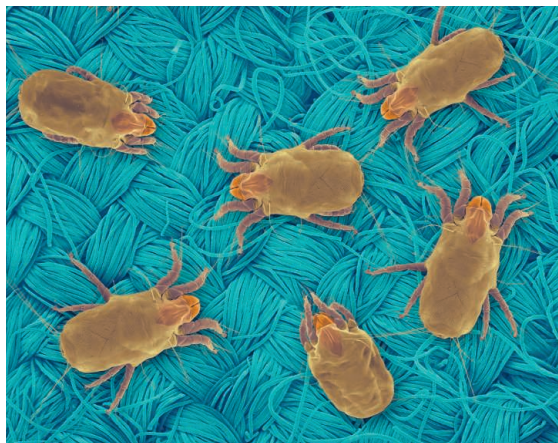
Mite-y vaccine. Dust mites such as Dermatophagoides farinae (pictured) are a trigger of allergies and asthma, prompting efforts to immunize people against one of their proteins.